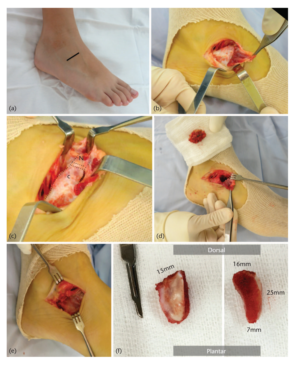
Fig. 2 Surgical technique for calcaneonavicular coalition excision: (a) Ollier's incision, (b) mobilizing extensor digitorum brevis (EDB), (c) the calcaneonavicular coalition, (d) defect post coalition resection and fat interposition graft, (e) repair of EDB origin, (f) resected specimen.

interposition.<sup>22</sup> In a small comparative study, Moyes et al demonstrated a reduction in recurrence rate from 43% to 10% by using EDB to fill the defect instead of the traditional non-interposition method.<sup>23</sup>