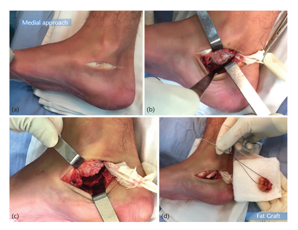
Fig. 6 Clinical photographs of resection of Type I talocalcaneal coalition in a symptomatic 13-year-old boy. (a) Medial approach centred over the sustentaculum tali. (b) The tibialis posterior is identified and retracted dorsally. The flexor digitorum longus (FDL) is retracted plantarward. The deep sheath is incised to expose the coalition. The synchondrosis between the talus and calcaneus is identified. (c) Resection is performed with small osteotomes and rongeurs, and is considered complete when range of motion is improved and the entire posterior facet is visualized. (d) The fat graft is placed in the defect and the wounds are closed.

As an adjunct to this CT-based classification, to aid surgical planning one must further consider the anatomical location of the TCC. The TCC may be extra-articular (either