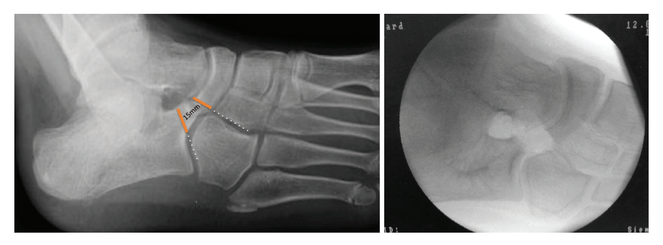
Fig. 5 (a) Resection margins of a calcaneonavicular bar, (b) intraoperative image after proper resection.