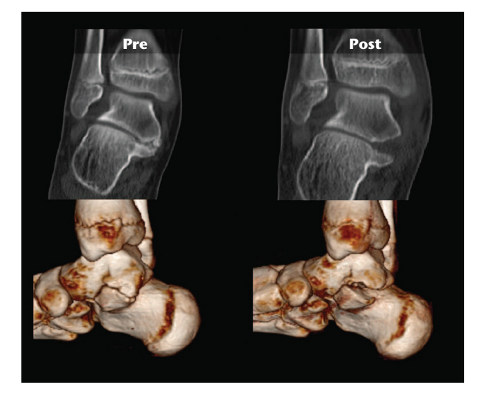
Fig. 7 The coronal and 3D reconstruction shows a linear talocalcaneal bar (Type I). Postoperative scan shows resection to undamaged articular cartilage respecting the sustentaculum tali.

In this case the pain is caused by the bar so the prescribed treatment is resection. This would be achieved through a medial approach centred on the sustentaculum tali, as illustrated in Fig. 6. As per resection of a calcaneonavicular bar, our interposition graft of choice is