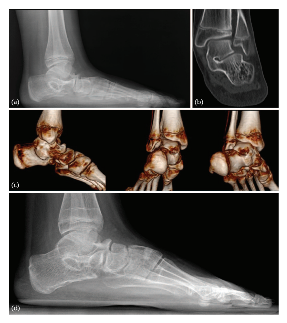
Fig. 8 Female, 11 years old with severe flatfoot deformity, limited range of motion and pain. (A) Lateral radiograph of the left foot with severe flatfoot and positive C-sign (+). (B) Coronal CT scan with severe hindfoot valgus deformity, and TC bony bar (Type V). (C) CT scan 3D reconstruction. (D) Lateral radiograph of the left foot after realignment without tarsal coalition resection (lateral column lengthening + medial sliding calcaneal osteotomy + medial cuneiform opening wedge plantarflexion osteotomy + tendoachilles lengthening). Foot is plantigrade and patient reported no symptoms or activities limitations at the two-year follow-up.