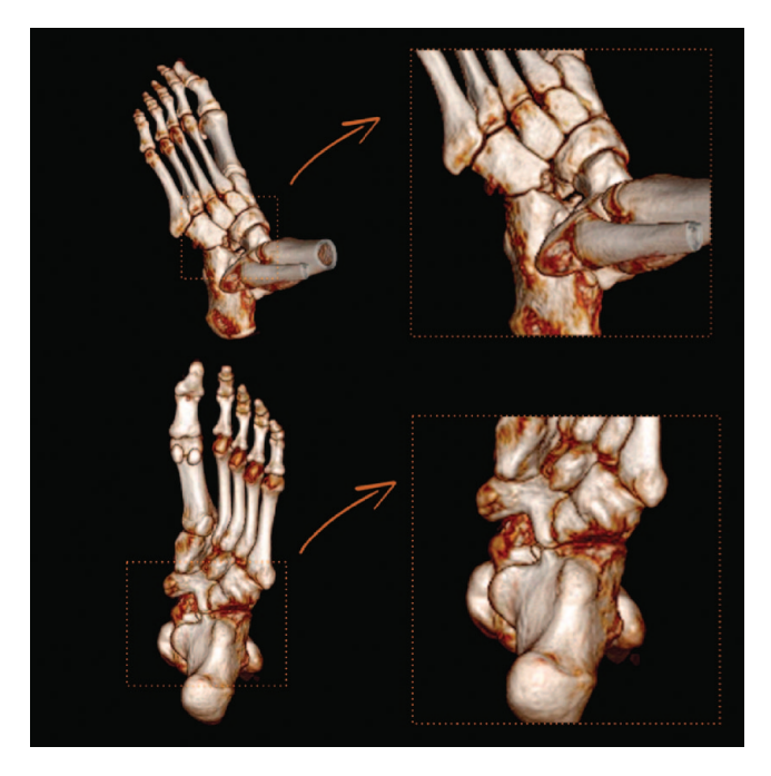
Fig. 4 A 14-year-old who consulted for pain and limited mobility after two failed attempts at removal of a calcaneonavicular bar. Note from the dorsum what appears to be a successful resection; however, the plantar view demonstrates incomplete resection of the coalition.

Masquijo et al demonstrated, in a three-leg study, that use of bone wax or fat as interposition was superior to EDB with respect to patient-reported outcomes and re-ossification rates.<sup>25</sup> It is our belief that fat interposition is the best, biologic method to fill the gap left after TCC resection, as illustrated previously. Recently an arthroscopic approach has been described for surgical resection of CNC.<sup>14</sup> Whilst good outcomes have been reported, the cases series is small with limited follow-up. In this approach no interposition material is used, thus raising concerns about the risk of coalition re-ossification. Limited space also makes access difficult and runs the risk of iatrogenic chondral or nerve injury. As such it remains the case, whether or not, an arthroscopic approach to CNC excision is superior to open with interposition graft.