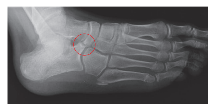
Fig. 1 Calcaneonavicular coalition on standing oblique radiograph, with 'anteater sign' highlighted.

Surgical resection of calcaneonavicular coalitions was first reported by Badgley in 1927,<sup>13</sup> and numerous other techniques have been subsequently described. In recent years arthroscopic resection has been attempted, with the purported benefits being a more aesthetic scar, quicker recovery and equivalent recurrence rates compared to open surgery.<sup>14,15</sup> The accepted gold standard, however, remains open surgical resection of the coalition and interposition graft. It is rare that such bars present with a foot deformity requiring realignment procedures alongside the resection. The open approach is that preferred by the authors and is described in detail below, alongside potential pitfalls which could affect clinical outcomes.